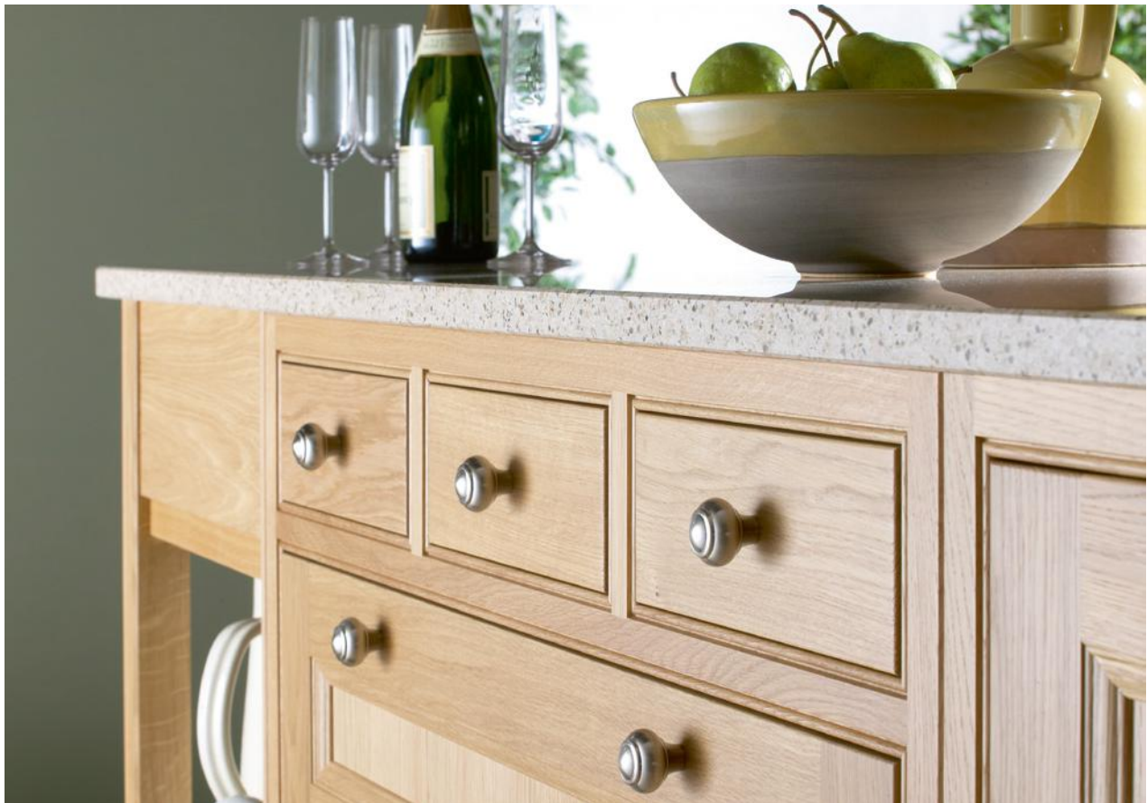
ABOVE TETBURY IN NATURAL OAK WITH KNOB (K144) OPPOSITE TETBURY IN NATURAL OAK AND PAINTED SOFT MOSS WITH KNOB (K144)