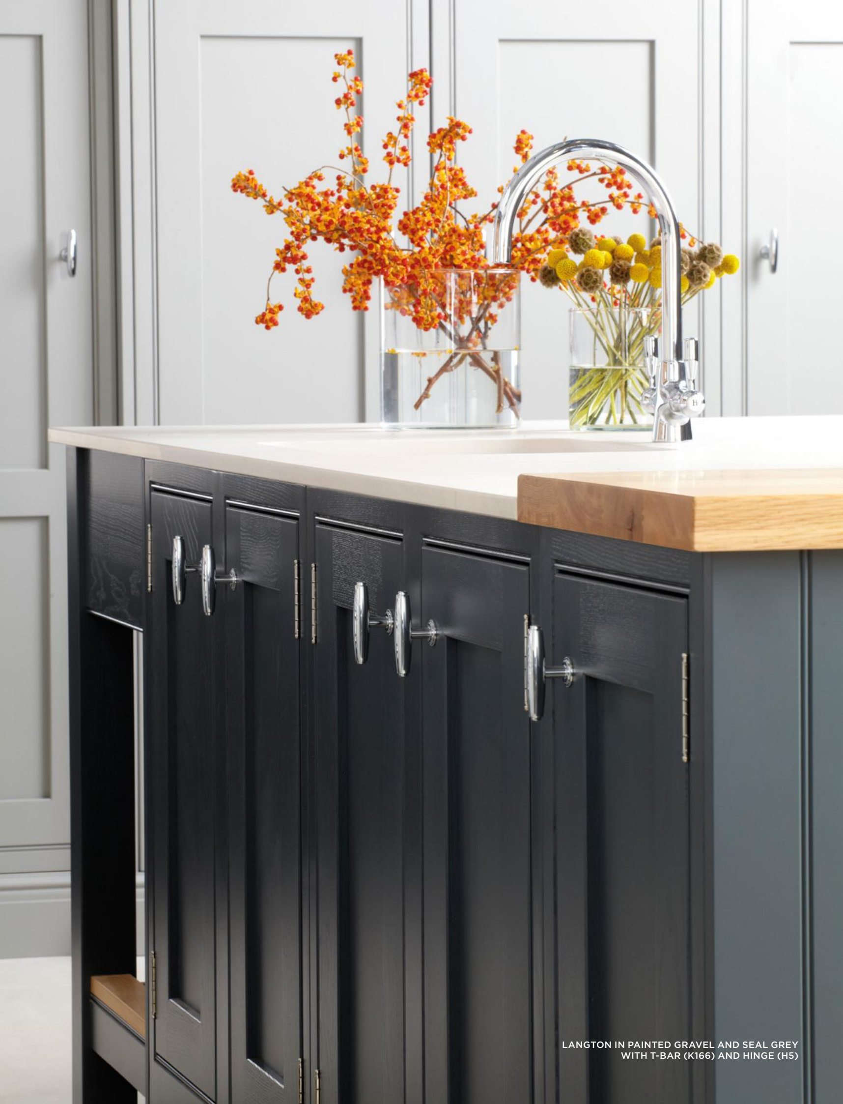
LANGTON IN PAINTED GRAVEL AND SEAL GREY WITH T-BAR (K166) AND HINGE (H5)