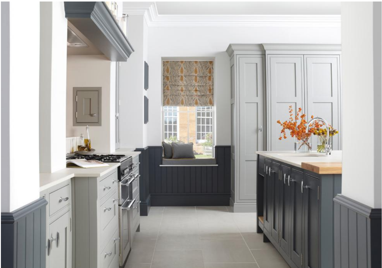
ALL IMAGES LANGTON IN PAINTED GRAVEL AND SEAL GREY WITH KNOB (K149), T-BAR (K166) AND HINGE (H5)