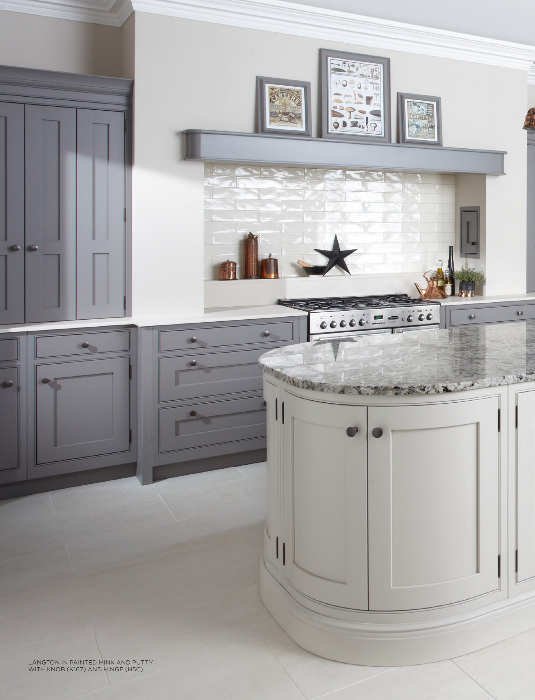
LANGTON IN PAINTED MINK AND PUTTY WITH KNOB (K167) AND HINGE (H5C)