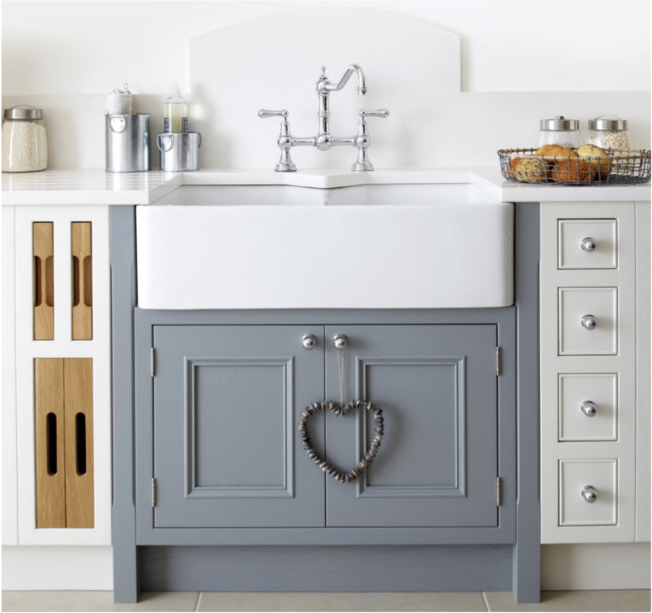
ALL IMAGES SALCOMBE IN PAINTED CHALK AND LEAD WITH KNOB (K149) AND HINGE (H3)