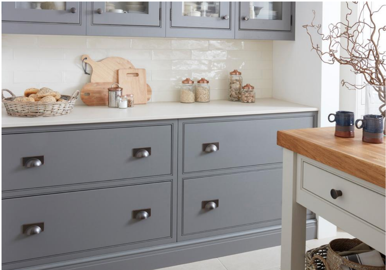
ABOVE LANGTON IN PAINTED MINK AND PUTTY WITH CUP HANDLE (K178) AND KNOB (K167) OPPOSITE LANGTON IN PAINTED MINK AND PUTTY WITH KNOB (K167) AND HINGE (H5C)