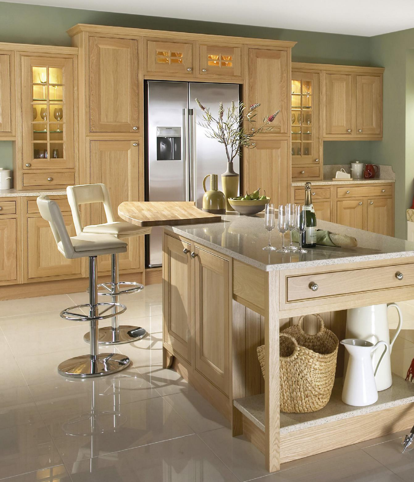
TETBURY IN NATURAL OAK WITH KNOB (K144)