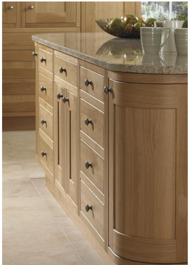
ALL IMAGES PETWORTH IN NATURAL OAK WITH KNOB (K134)