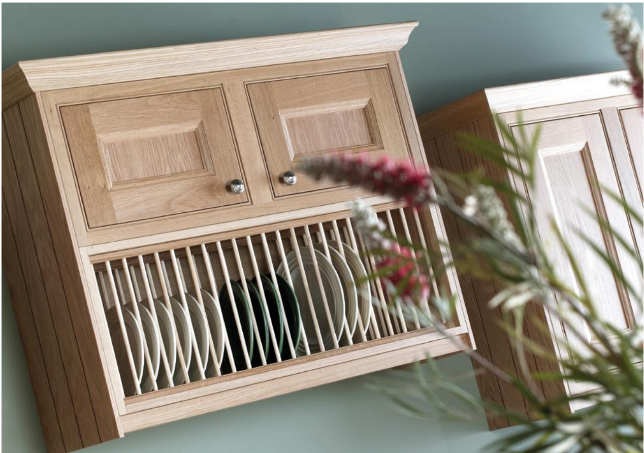
ALL IMAGES TETBURY IN NATURAL OAK AND PAINTED SOFT MOSS WITH KNOB (K144)