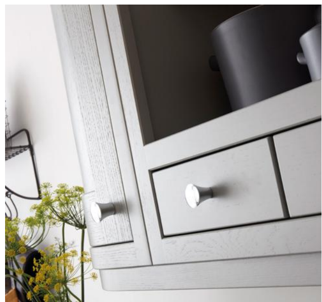
TOP PETWORTH IN PAINTED SEAL GREY WITH CUP HANDLE (K180) & KNOB (K175) BOTTOM LEFT PETWORTH IN PAINTED GRAVEL AND SEAL GREY WITH KNOB (K177) BOTTOM RIGHT PETWORTH IN PAINTED GRAVEL WITH KNOB (K175) OPPOSITE PETWORTH IN PAINTED GRAVEL AND SEAL GREY WITH CUP HANDLE (K180) & KNOBS (K175 / K177)