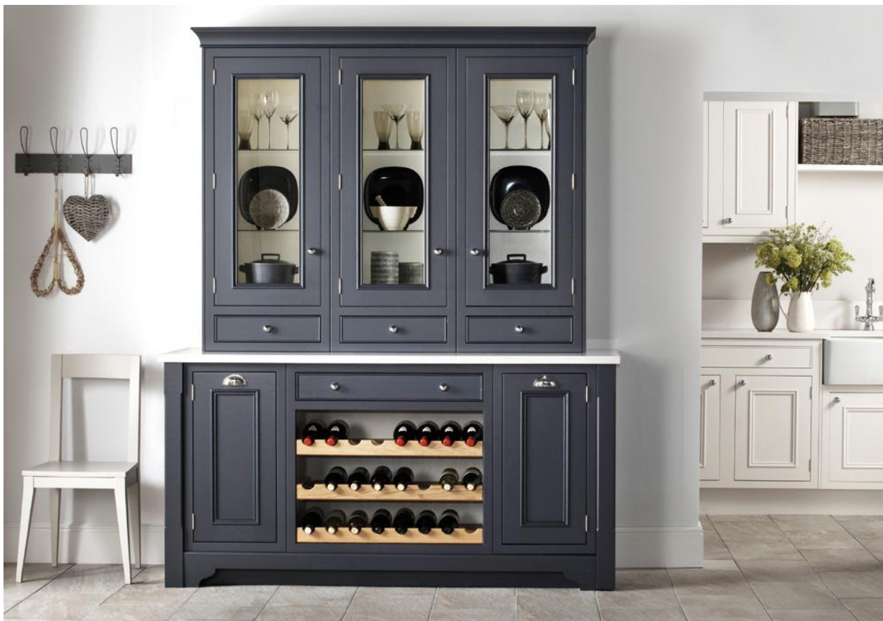
ABOVE SALCOMBE IN PAINTED CHALK AND CHARCOAL WITH CUP HANDLE (K150), KNOB (K149) AND HINGE (H3) OPPOSITE SALCOMBE IN PAINTED CHALK WITH CUP HANDLE (K150), KNOB (K149) AND HINGE (H3)