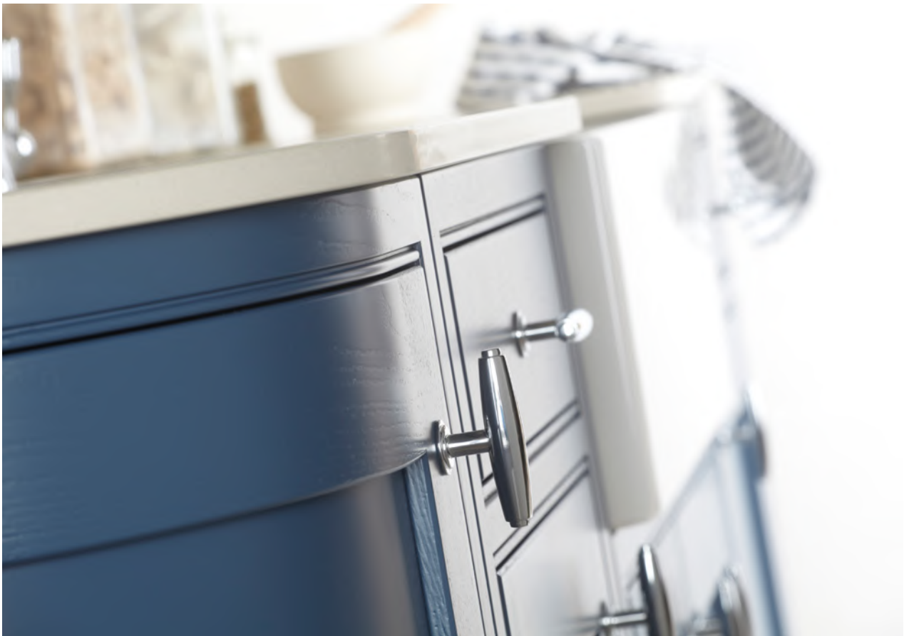
ALL IMAGES LANGTON IN PAINTED OLD NAVY AND SOFT GREY WITH T-BAR (K166)