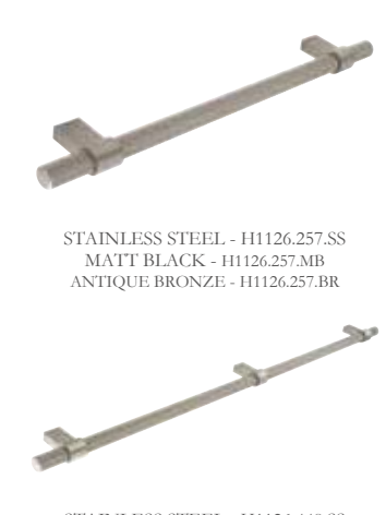
STAINLESS STEEL - H1126.448.SS MATT BLACK - H1126.448.MB ANTIQUE BRONZE - H1126.448.BR