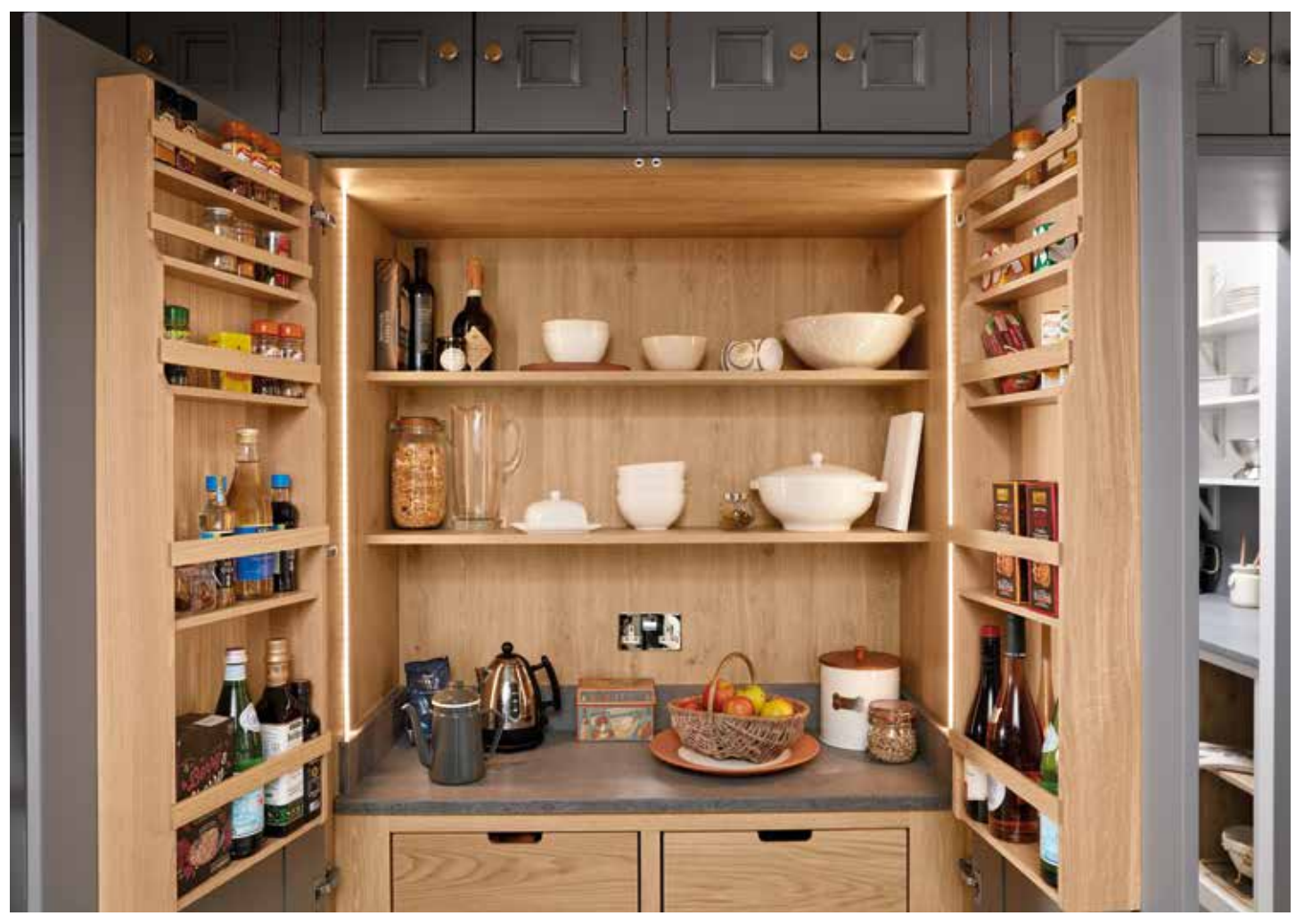
Washed oak butler's pantry with Caesarstone Rugged Concrete worksurface.

Creating an abundance of storage space through integrated full height larders and a concealed pantry, this Georgian kitchen is perfectly aligned with everyday life. Utilising the area to create additional zoned workspace, a separate breakfast area, or even keeping the toaster and kettle tucked away, this kitchen provides a fresh approach to a traditional timeless design.